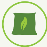
The sludge can be sold as organic fertilizer.