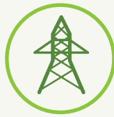
Conversion into electricity