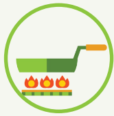
Fuelling gas cookers