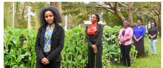
BioInnovate Africa cohort two women fellows.

Click here to view profiles of the BioInnovate Africa women fellows.