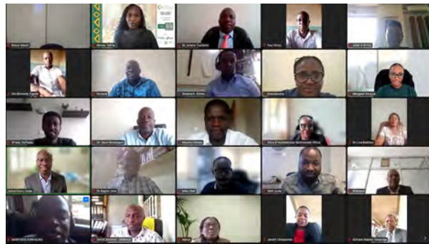
BiInnovate Africa virtual progress update and technical review meeting with phase III project implementing partner held 20/06/2024.

Between February and July 2024, BiInnovate Africa Programme Management Office (PMO) conducted on-site visits and virtual meetings to provide implementation support to its project implementing partners. The support included technical and financial guidance.