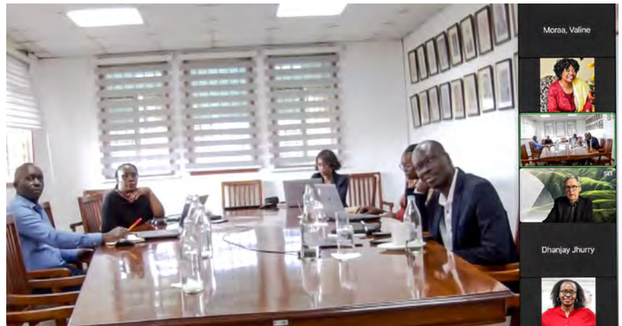
19th BioInnovate Africa PAC meeting held on 27/03/2024.

The 19th and 20th BioInnovate Africa PAC meeting were held virtually on 27 March 2024 and 22 August 2024 respectively. Both meetings discussed BioInnovate Africa updates and progress and strategised for upcoming activities aimed at enhancing effectiveness in fostering bioeconomy development in Africa.