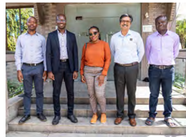
BiInnovate Africa conducted technical and financial monitoring visits to selected project implementing partners in Kenya, Tanzania, and Uganda.