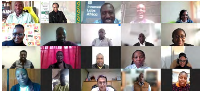
BioInnovate Africa virtual workshop on Intellectual Property for its current project implementing partners.